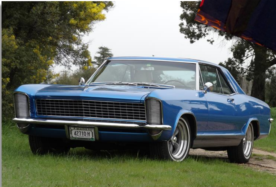
Some of the winners on the day.