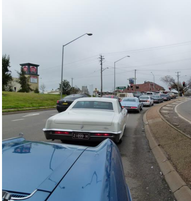
A Line of Rivs invade Wagga