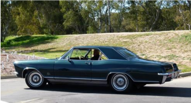
Ross and Jill Nye 1965